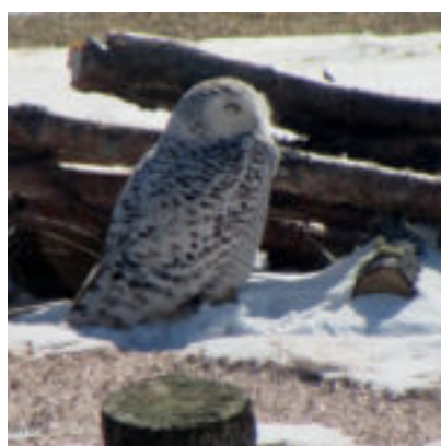
Snowy Owl – Feb. 2016