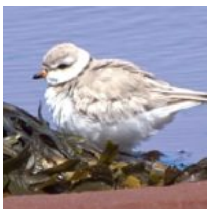
Piping Plover chick – North Lake, PEI – June 15, 2018

GLEN ROAD , Glencorradale, Rte 303 (Glen Road) from Rte 302 (Baltic Road) – Scenic Heritage Road – farmland, woodland – large elm tree at eastern end – Google map here .